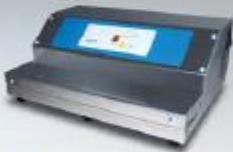
FAST 32 digit