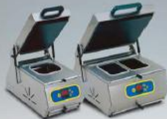
SV 300 digit