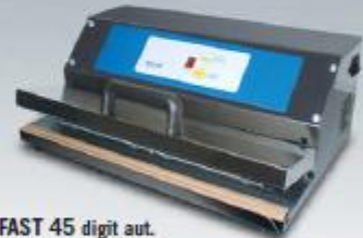
FAST 45 digit aut.