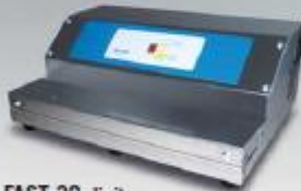
FAST 38 digit