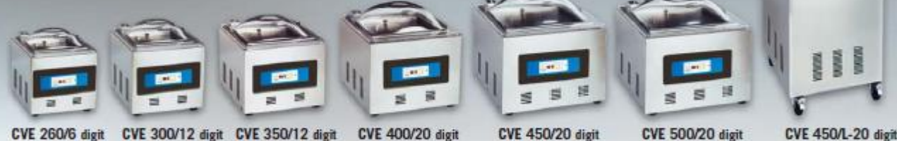
CVE 260/6 digit CVE 300/12 digit CVE 350/12 digit CVE 400/20 digit CVE 450/20 digit CVE 500/20 digit CVE 450L-20 digit