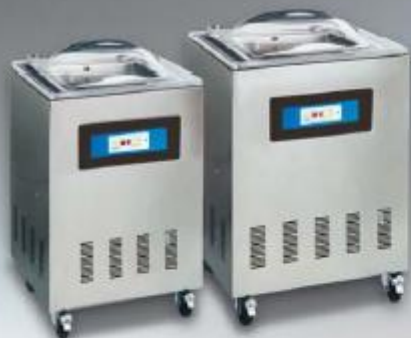
CVE 450/2 digit