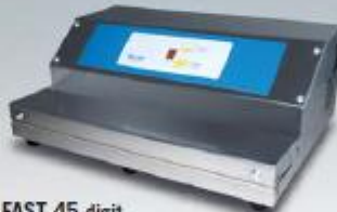
FAST 45 digit