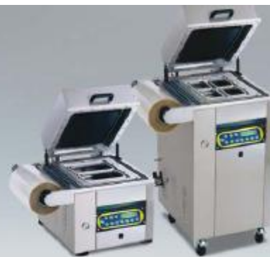
VG 600 digit